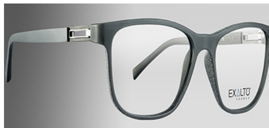
« FRAME TECHNOLOGICAL INNOVATION » CATEGORY OXIBIS GROUP WITH « 77H » D'EXALTO