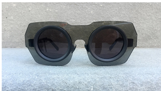
« JURY SPECIAL PRIZE » KUBORAUM WITH « MASKE E3 »