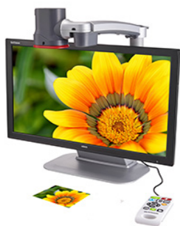
« LOW VISION » CATEGORY VISIOLE WITH « GO VISION »