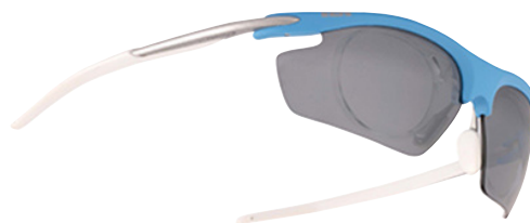
« SPORT EQUIPMENT » CATEGORY DEMETZ WITH « LAZER-RUN »