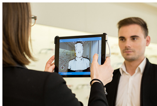
« EQUIPMENT/MATERIAL » CATEGORY NETLOOKS WITH « NETLOOKS 3D »