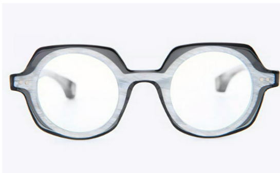
« OPTICAL » CATEGORY BLACK KUWAHARA WITH « KAHN »