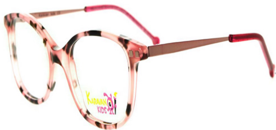
« CHILDREN » CATEGORY KARAVAN & CO WITH « BILI » DE KARAVAN KIDS